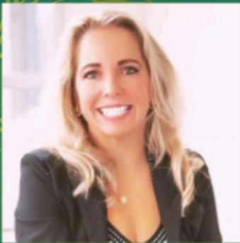
Pinnacle Financial Partners